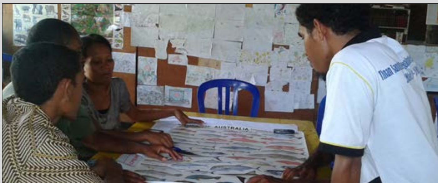
Fig 4: Fishers in Atauro, Timor-Leste, used other resources (fish species posters) to discuss, develop and refine their decision-trees for considering a range of adaptation actions.