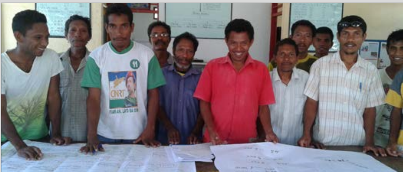
Fig 5: Fishers in Atauro, Timor-Leste, developed and refined decision-tree structures and estimated costs and benefits to enable partial cost-benefit analysis to be conducted on a range of fishing-related adaptation actions. This provided information to help make decisions about the most economically profitable adaptation option.